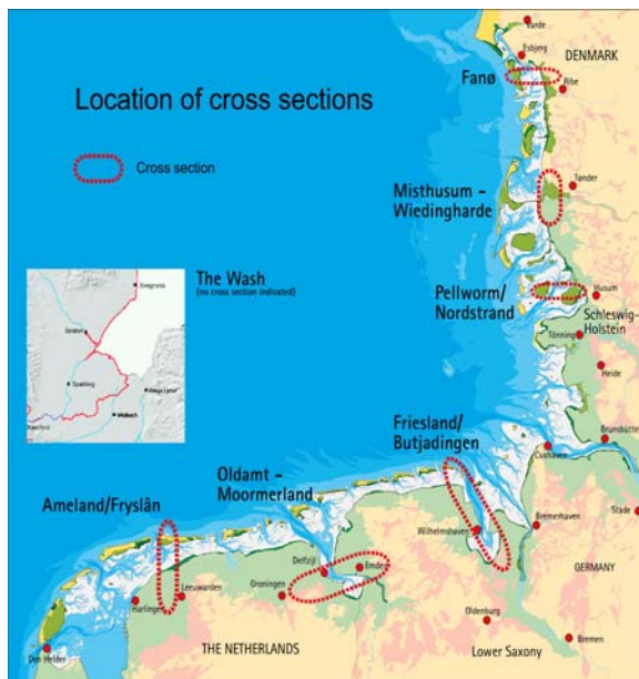
Location of cross sections