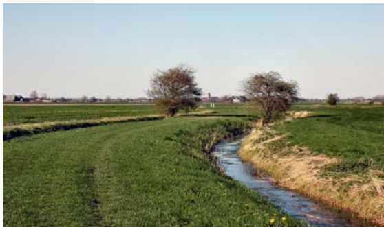
Stadweg, NE of Groningen

One can read the cultural history in the individual buildings but also in the city plans. In the processes of change, it is important to take those values into account. It needs integrated management. What are the effects of the major developments on the settlements, especially on the landscape and the heritage and can we manage them?